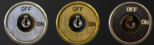
Key lock-outs and touch key pads