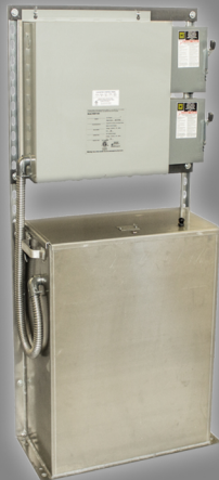
Free Standing Option