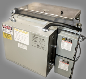
Low Mount Option